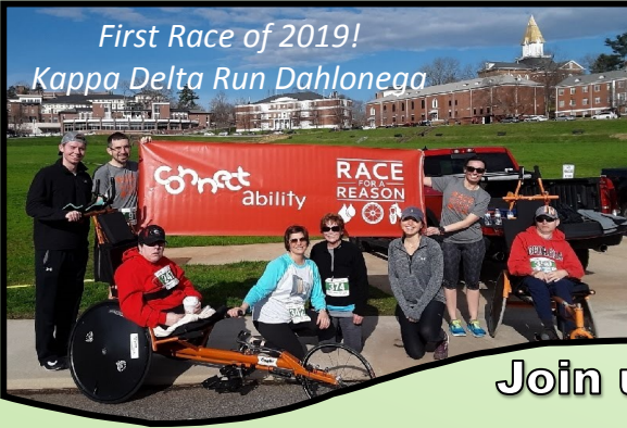
First Race of 2019! Kappa Delta Run Dahlonega